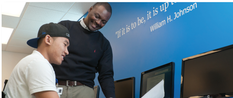
Franklin County Youth Mentoring program helps not only the youth and mentor but the entire community.

The Franklin County Youth Mentoring program serves youth, ages 12 to 17 in Franklin County, Virginia using the Big Brothers Big Sisters (BBBS) mentoring model, which emphasizes long-term evidence-based practices, and provides significant and effective bridging and bonding opportunities for at-risk youth. Mentored youth experience reduced rates of recidivism, diminished drug and alcohol misuse, and increased on-time high school graduation rates among at-risk youth involved in the criminal justice system. Participating youth will also improve social competence and develop successful and meaningful adult relationships with mentors, parents and guardians.