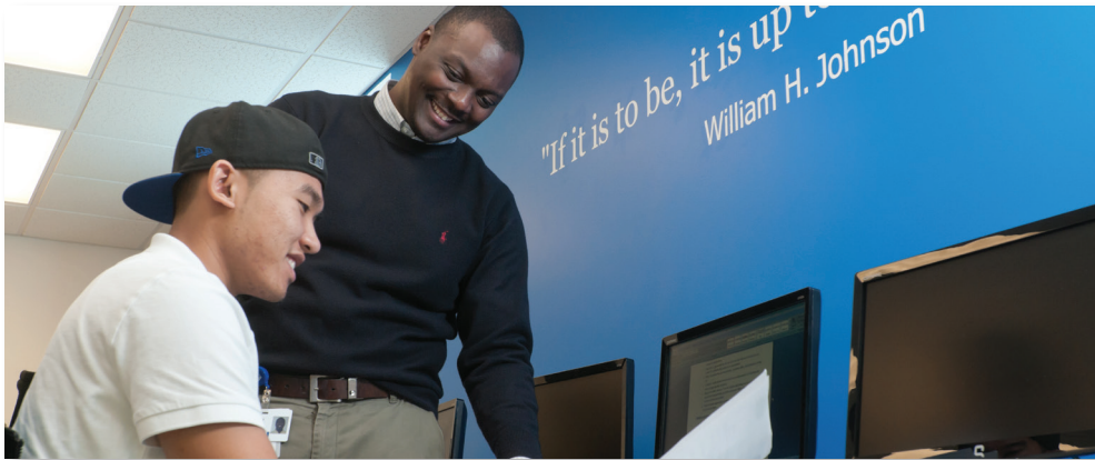
Franklin County Youth Mentoring program helps not only the youth and mentor but the entire community.

The Franklin County Youth Mentoring program serves youth, ages 12 to 17 in Franklin County, Virginia using the Big Brothers Big Sisters (BBBS) mentoring model, which emphasizes long-term evidence-based practices, and provides significant and effective bridging and bonding opportunities for at-risk youth. Mentored youth experience reduced rates of recidivism, diminished drug and alcohol misuse, and increased on-time high school graduation rates among at-risk youth involved in the criminal justice system. Participating youth will also improve social competence and develop successful and meaningful adult relationships with mentors, parents and guardians.