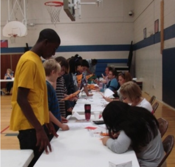
Franklin County High School, Rocky Mount

Reality Check provides students a glimpse at what real life will be like. From paying bills, caring for children and pets, to managing through unexpected expenses, it is a true reality check to see if what they are planning to do for a career will give them the lifestyle they envision for themselves.