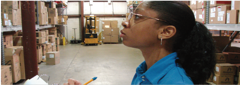
Goodwill's Project SEARCH: Carilion Clinic program provides opportunities for youth with disabilities to be work ready.

Students also have the added benefit of learning life skills, such as utilizing public transportation to report to work sites. The ultimate goal, upon program completion, is to have the skills necessary to obtain competitive employment.