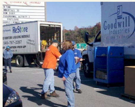
Donors give generously at the 3rd Annual Project GIVE on November 12th.