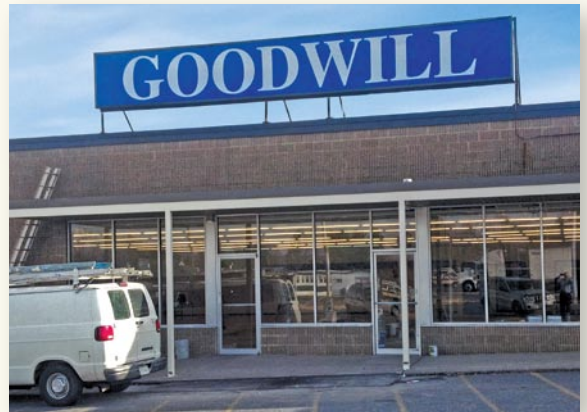
Final work being done in preparation for Verona store's January opening.

the store will be in the storefront previously occupied by Dollar General. A Goodwill Attended Donation Center has been located on the same parking lot for several years. Beginning the week of January 16th the Attended Donation Center will close and donations will be accepted at the store.